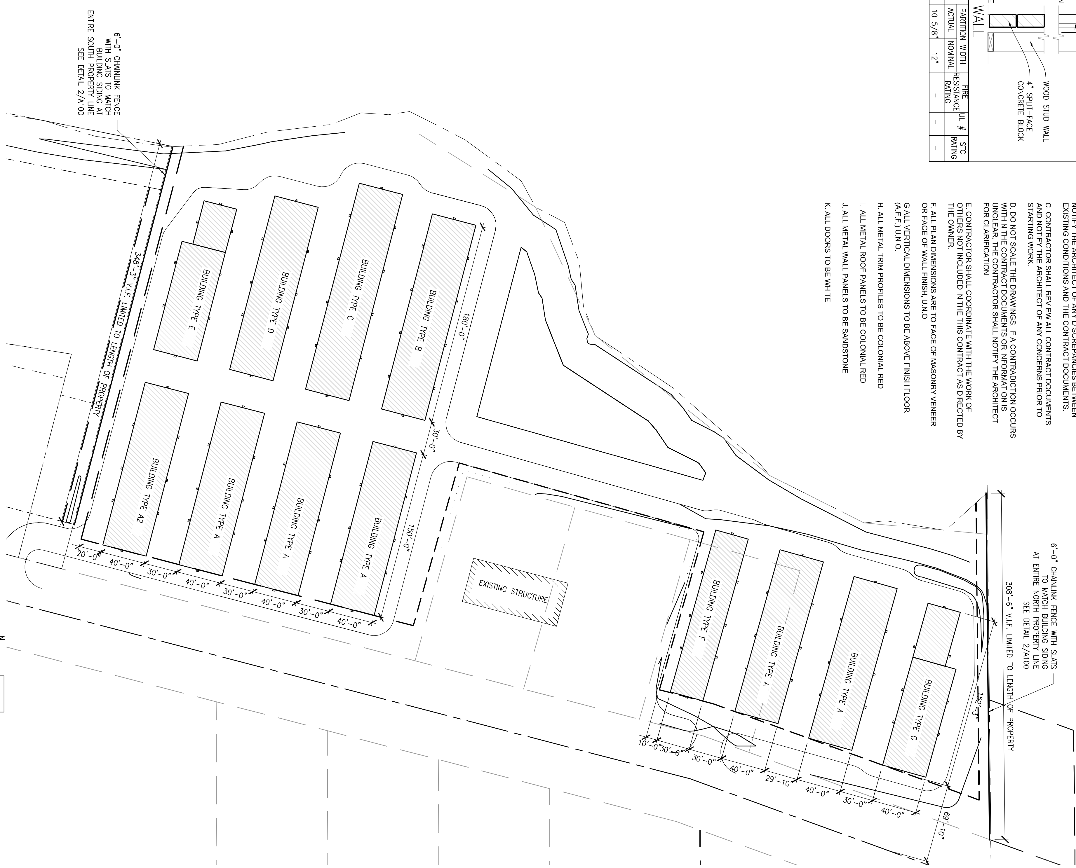
1 SITE PLAN